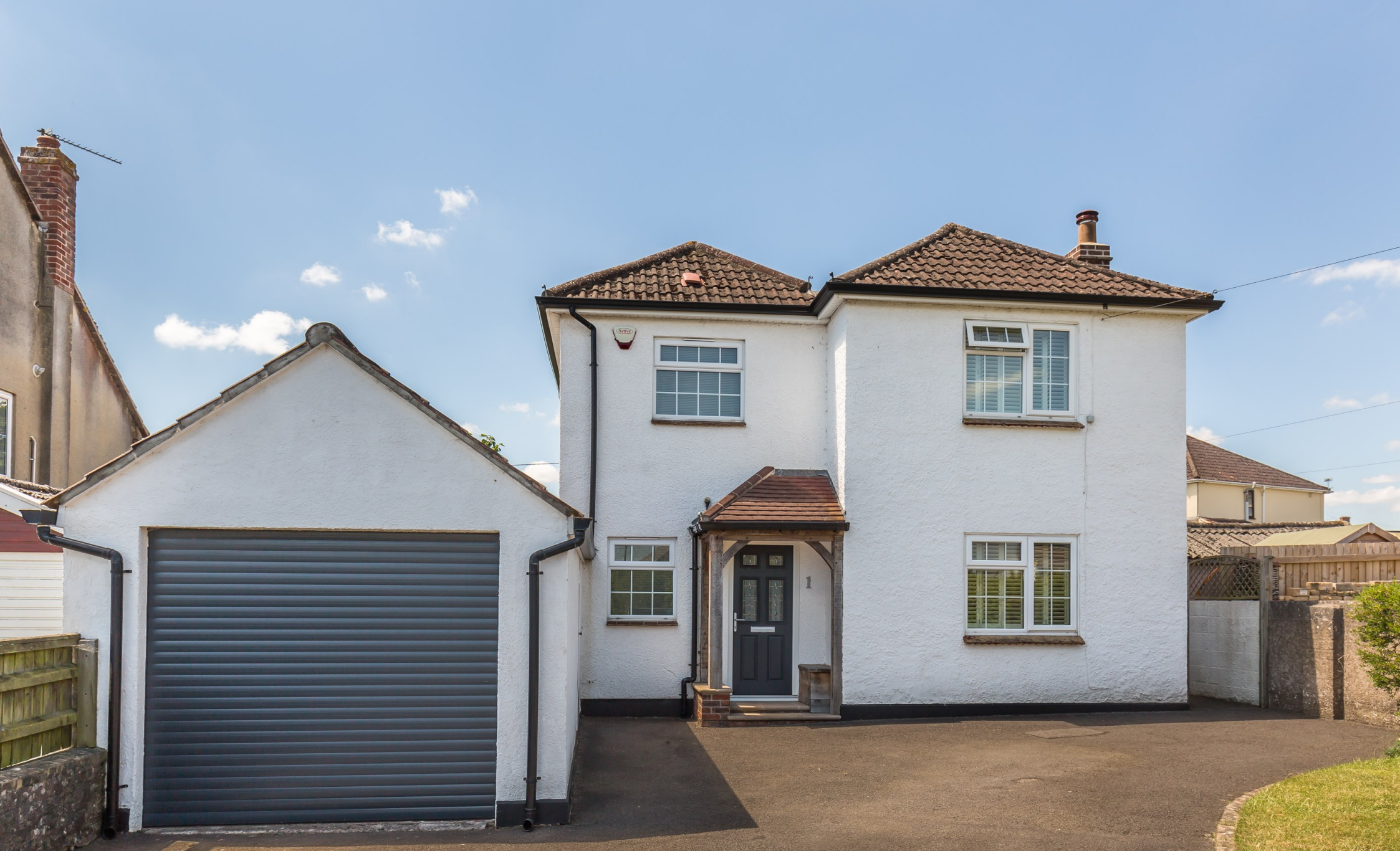
Stourton View, Frome